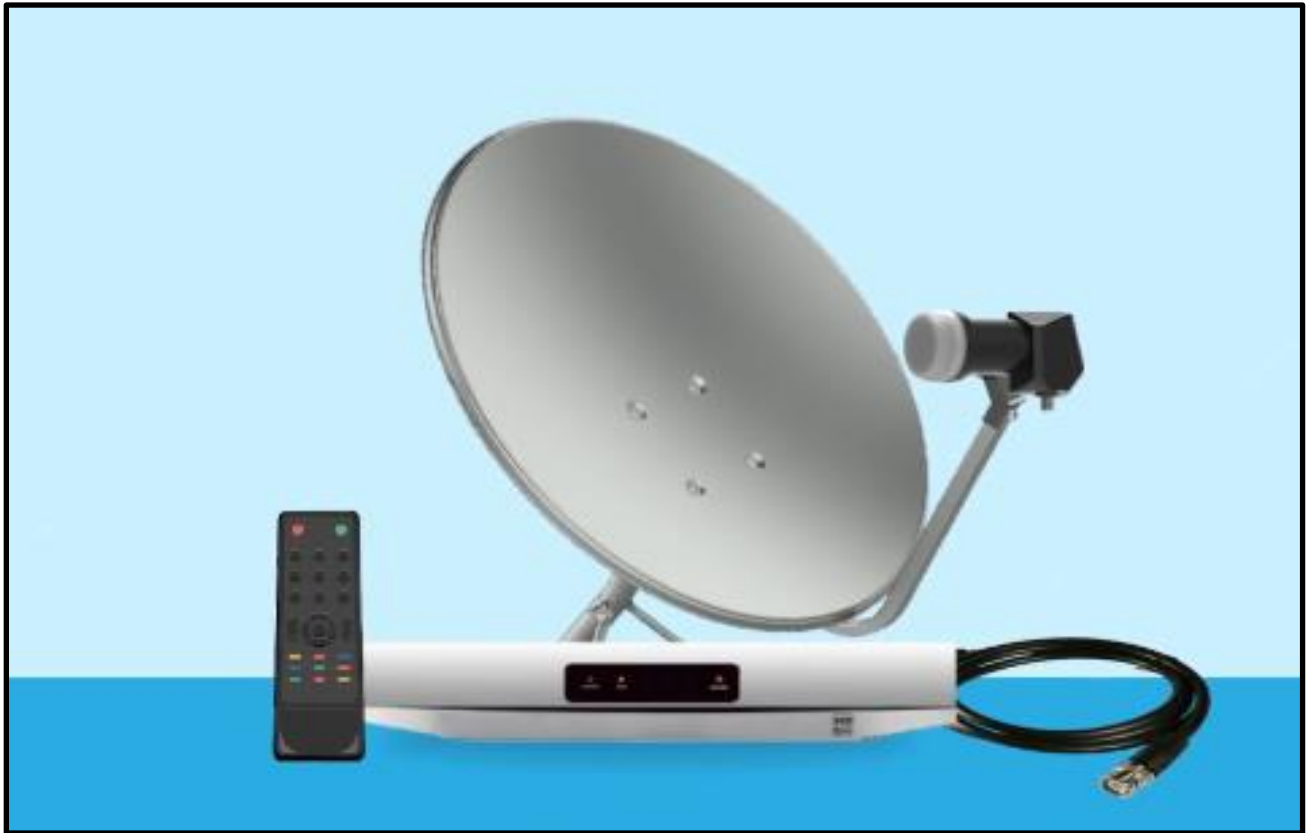
DD Free Dish DTH Set